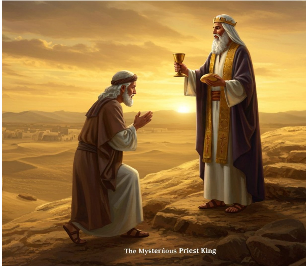
The Mysterious Priest King